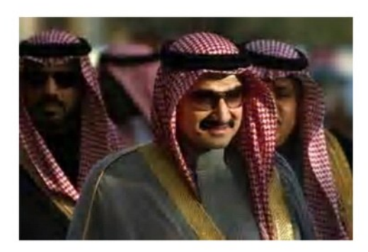
Pictured: Saudi Prince Al-Walid bin Talah

Over 49 separate law suits have been filed on the eligibility/birth certificate issue alone, with several of the suits making it all the way the United States Supreme Court, only to be denied a full hearing.